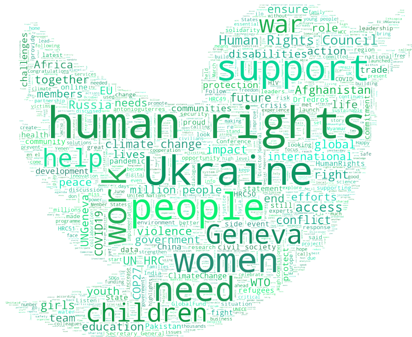
Most prominent terms based on Geneva organisations' tweets in 2022

For the 8th Geneva Engage Awards, Diplo's AI and Data team enhanced the analysis of Geneva's online outreach by identifying the most tweeted terms by Geneva-based organisations in the past year. Based on the tweet analysis, they identified the key 'influencers' in Geneva in 2022.